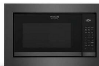
27" DARK STAINLESS TRIMKIT (GMTK2768AD)

* MICROWAVE (GMBS3068AD) PICTURED ABOVE PAIRED WITH BLACK STAINLESS STEEL TRIM KIT (GMTK3068AD / GMTK2768AD)