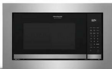
30" STAINLESS TRIMKIT (GMTK3068AF)