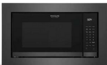
30" DARK STAINLESS TRIMKIT (GMTK3068AD)