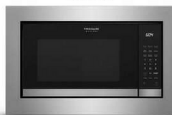
27" STAINLESS TRIMKIT (GMTK2768AF)

* MICROWAVE (GMBS3068AF) PICTURED ABOVE PAIRED WITH STAINLESS STEEL TRIM KIT (GMTK3068AF / GMTK2768AF)